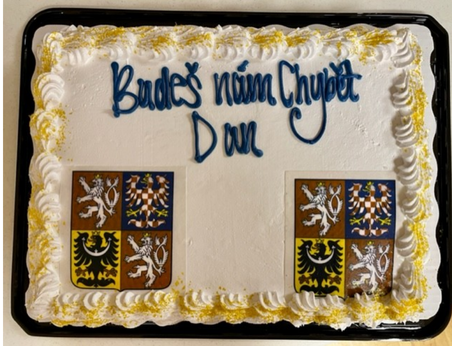
The going-away cake for Dan U.