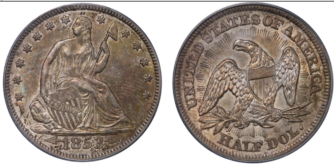
The rays were removed at the end of 1853, but the arrows continued through 1855.